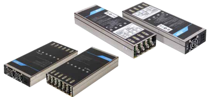
μMP Series configurable power supply from Artesyn

Having determined the appropriate input and output power range, the system design team can implement a board layout with a power supply footprint and connections that will remain constant for the life of the product.