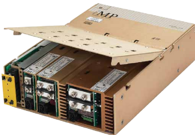
iMP Series configurable power supply from Artesyn