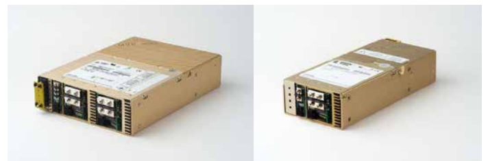
MP Series configurable power supply from Artesyn

Thus configurable and programmable power supplies offer the user the ability to customize the electrical specifications of a fixed-footprint base unit over a defined voltage range.