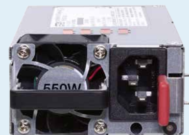
IEC C14 option