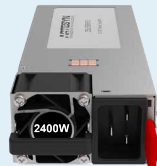
IEC C20 option

Artesyn CSU series CRPS AC-DC power supplies are all designed in the same standard short form factor to provide a scalable input power conversion solution.